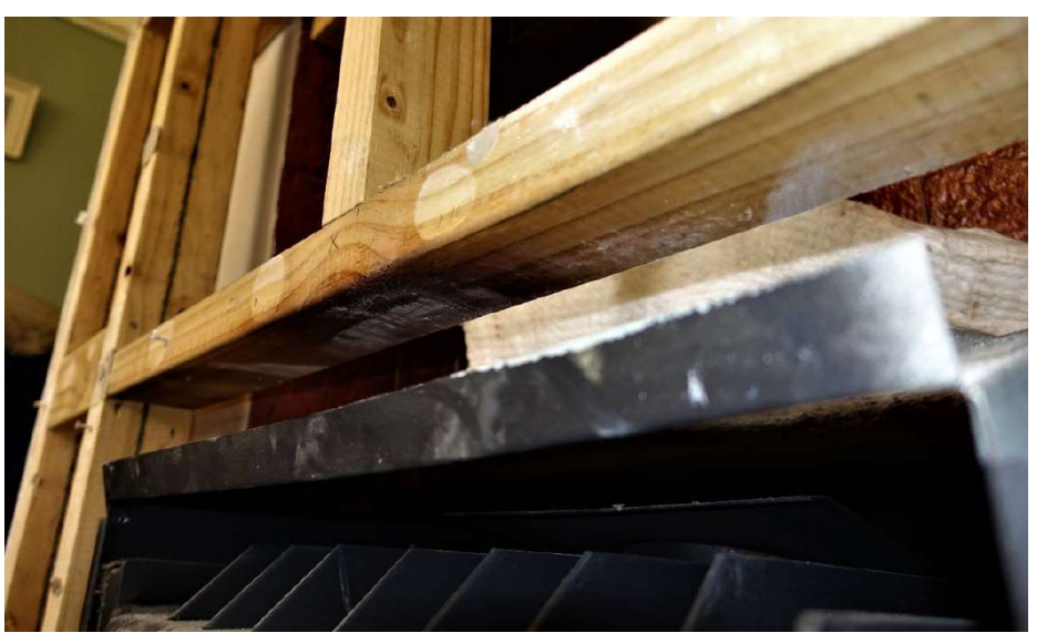
Figure 3: Photograph of a scorch mark on the timber framing

2.14 The Ministry received an application for determination on 18 August 2020, which was accepted on 3 September 2020.