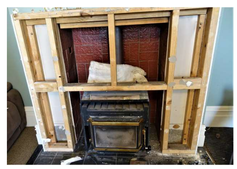
Figure 1: Photograph of the as-built woodburner