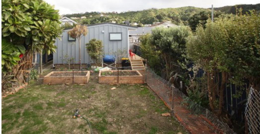
Figure 1: The new dwelling and northern path